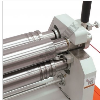
Wire Groove Rolls