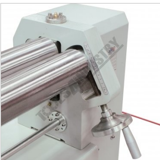
Curving Roller Height Adjustment Right Side