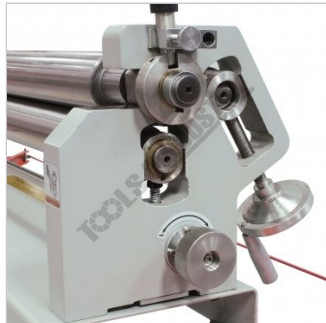
Material Thickness and Curving Roller Adjustment