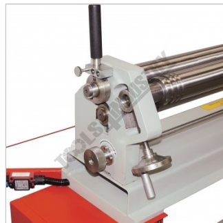
Rear View of Curving Roll Adjustment