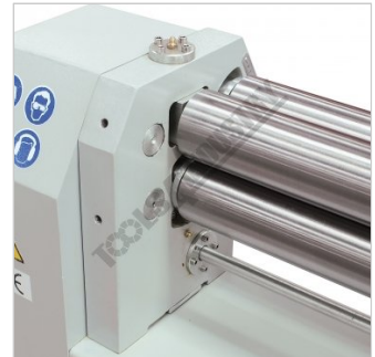
Left View of Rolls