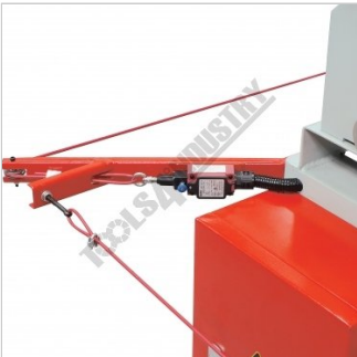
Safety Trip Wire Micro Switch