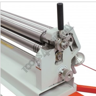
Right View of Rolls