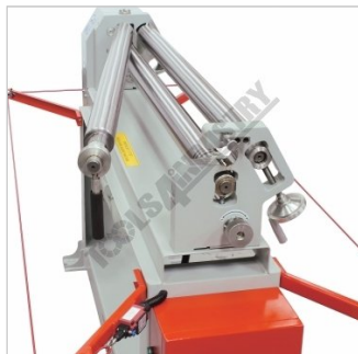
Swing Out Top Roller