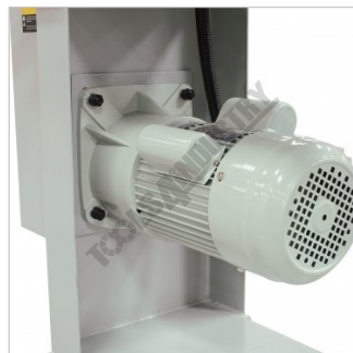
Main Drive Motor