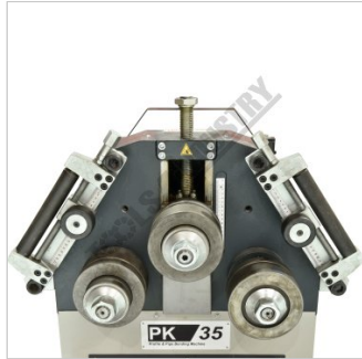
Pair Shown On Machine