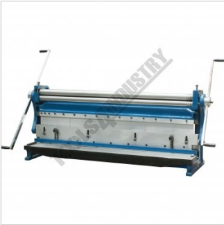
Rolls Full View