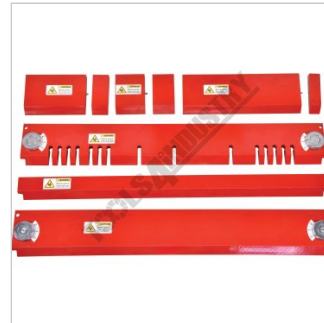
Included Material Clamp Bars