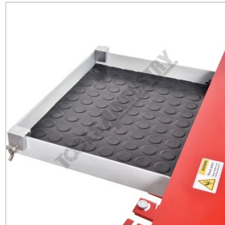
Clamp Bar Tray