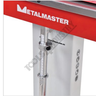
Bend Angle Guide