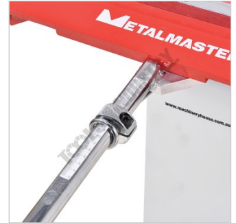
Bend Angle Guide Stop