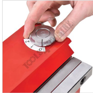
Material Thickness Clamp Adjustment 2