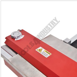
Material Length Stop