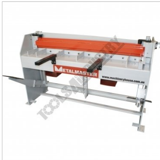
Right Top View