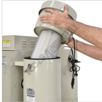
Motor Filter Assembly Being Removed