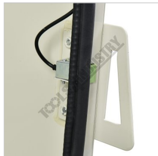
Door Safety Interlock