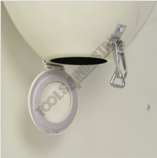
Dust Collector Emptying Hatch