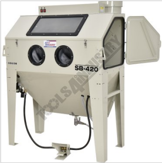
Side Door Open