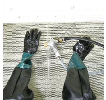
Gloves Top View