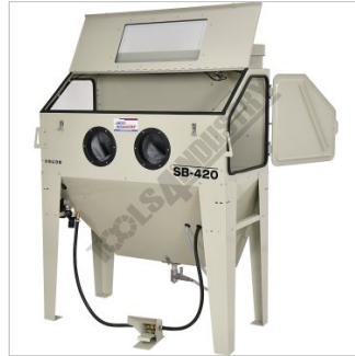
All Doors Open