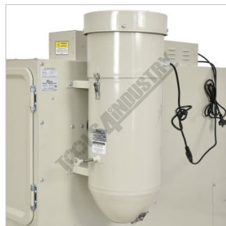
Dust Collector and Filter System