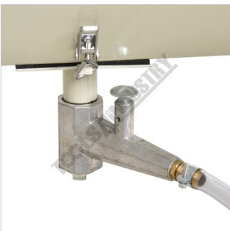
Abrasive Metering Valve