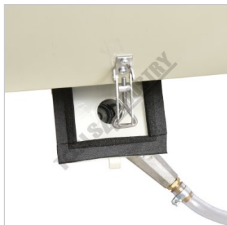
Hopper Emptying Hatch