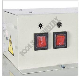
Switches for Light and Dust Collector