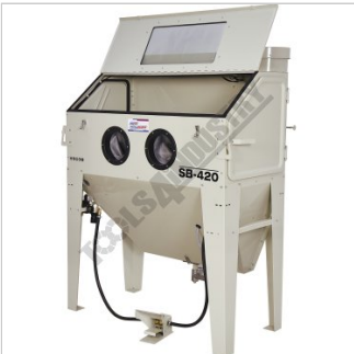
Right View Top Lid Open