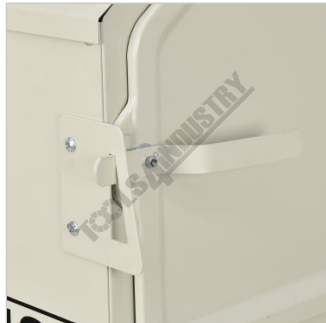
Side Door Handle