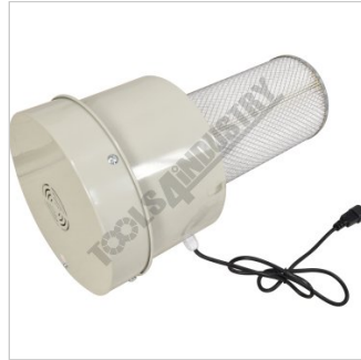
Motor Filter Assembly Removed