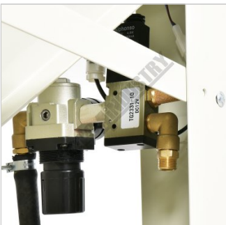
Compressed Air Inlet Connection