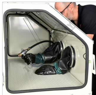
Gloves and Gun Action Shot