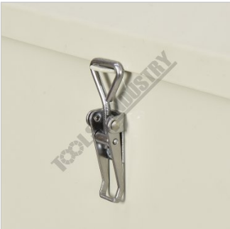
Top Lid Latch