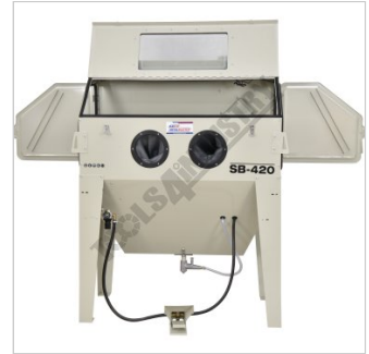
Front View All Doors Open