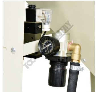
Air Pressure Gauge Assembly