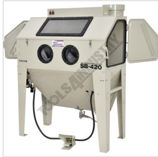
Side Doors Open