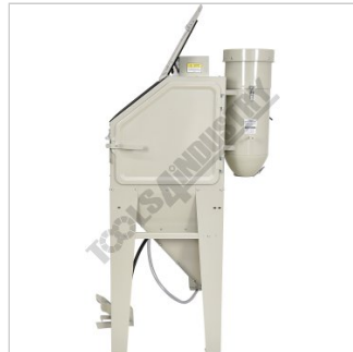
Right View Lid Open