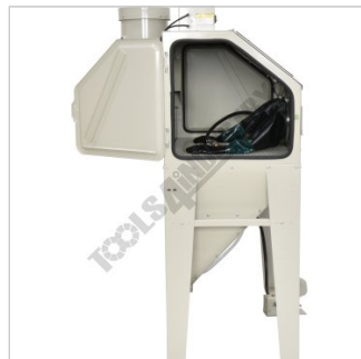
Left Side View Side Door Open