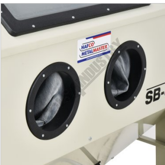
Gloves Front View