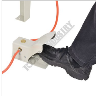
Foot Pedal Action Shot