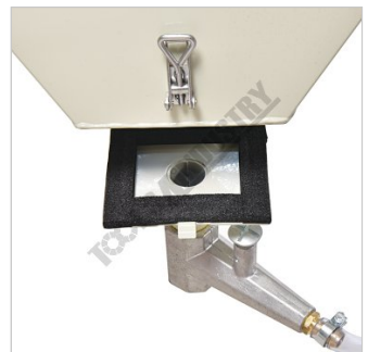
Hopper Emptying Hatch