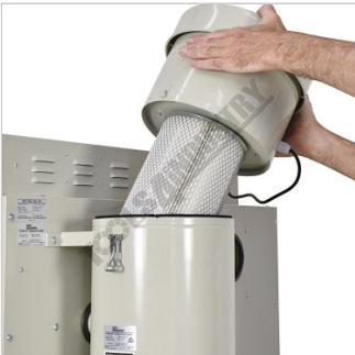
Removing Motor Filter Assembly