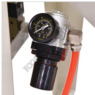
Air Pressure Gauge