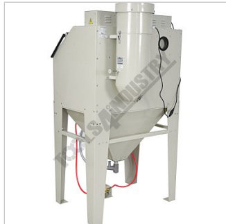
Rear Left View