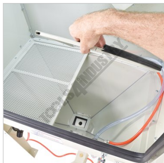
Hopper with Removable Grates