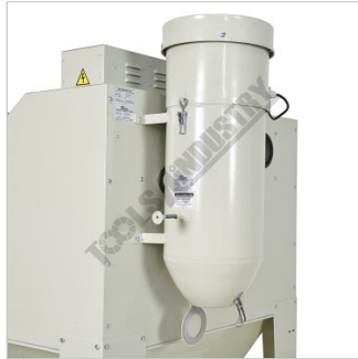
Dust Collector and Filter System