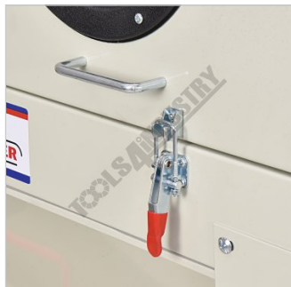
Lid Open Latch