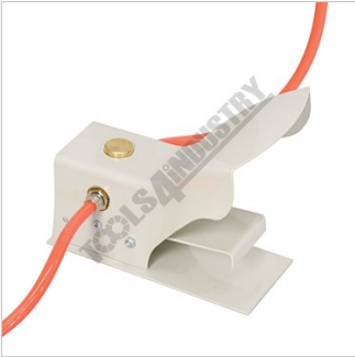
Foot Pedal Blasting Switch