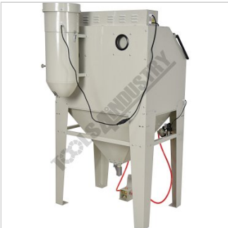
Rear Right View