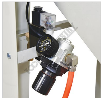
Air Pressure Gauge Assembly