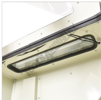
Internal Light with Tear Off Film on Glass