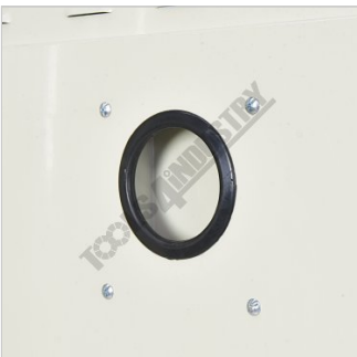
Air Intake Breather