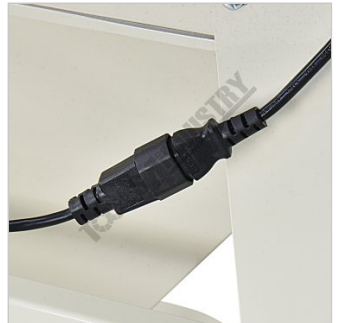
Filter System Connection Lead