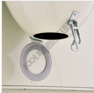
Dust Collector Emptying Hatch