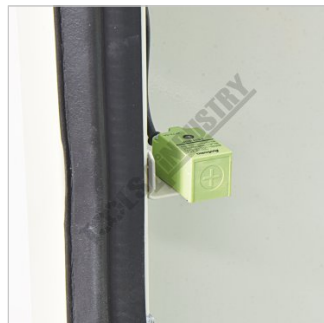
Door Safety Interlock