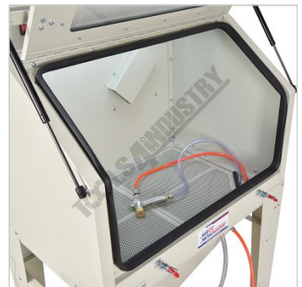
Inside Work Area