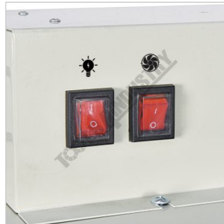
Switches for Light and Dust Collector