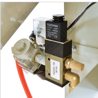
Solenoid Valve Assembly