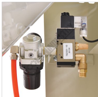
Compressed Air Inlet Connection