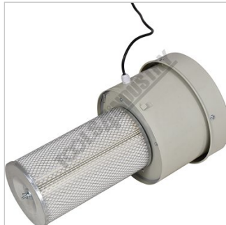
Motor Filter Assembly Removed