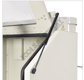
Gas Strut Door