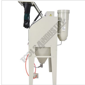
Side View Lid Open