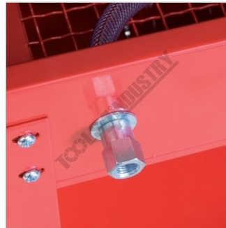
Fitting for Compressed Air Inlet