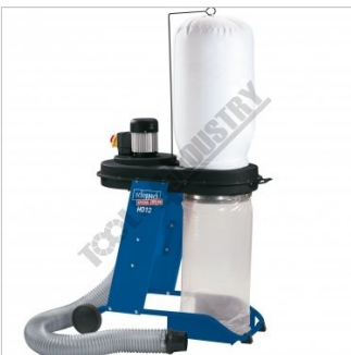
Recommended To Be Use With A Dust Collector