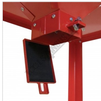
Bottom Release Trap