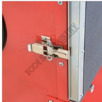
Latch Lock to Side Door