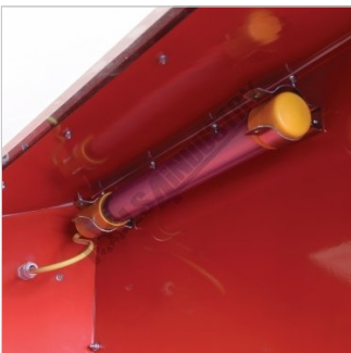
Internal Low Voltage Light