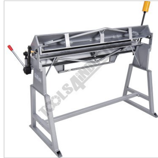
Rear Left View