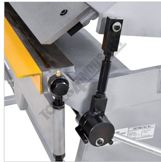
Lubrication Points Right Side