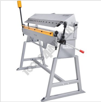
Material Clamp Blade Up