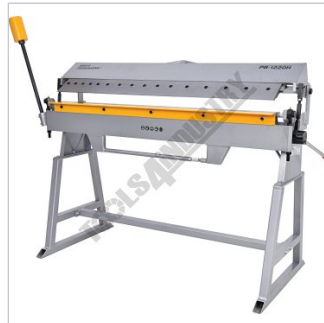
Shown with Material Clamp Blade Up