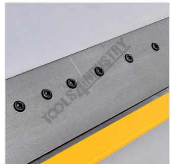
Removable Fingers for Bending Pans or Boxes