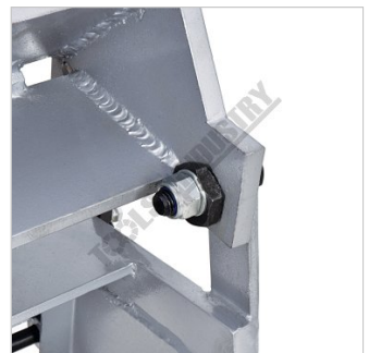
Clamp Leaf Setback Adjustment