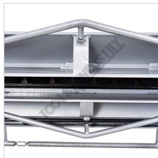
Crown Adjustment Rear View CloseUp