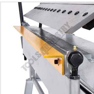
Removable Lower Bending Support Angle