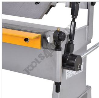
Lower Bending Leaf Height Adjustment