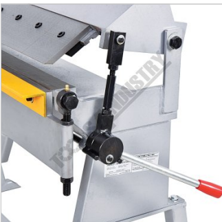
Material Clamp Blade Lever Up