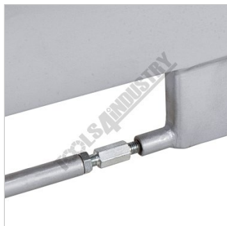
Crown Adjustment Rod