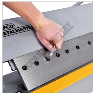
Removable Fingers Action Hex Key