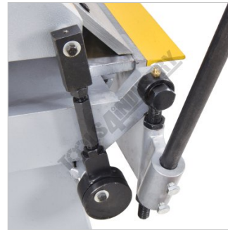
Lubrication Points Left Side