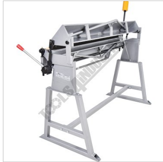
Rear Left View 2