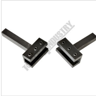
Custom Die Holders