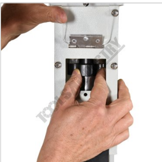
Switching Hammer Mode