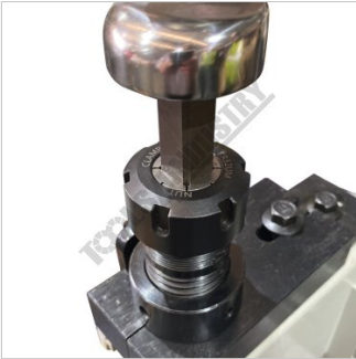
Quick Change Tooling