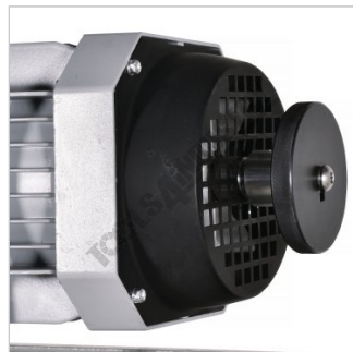
Top Die Wheel Adjustment