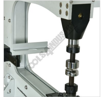
Reinforced 12mm Frame