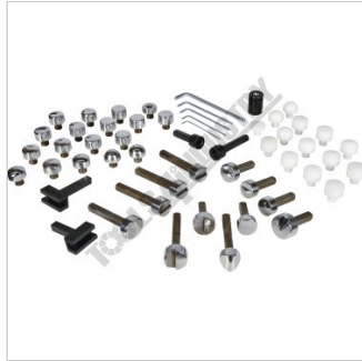
Full Die Set-Accessories