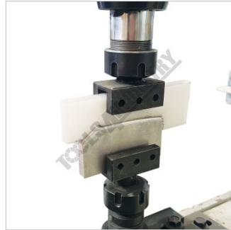
Shown Setup with Optional Custom Tooling