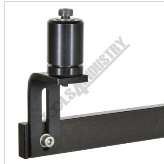
Round Roller Guide