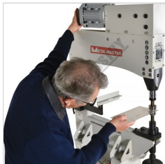
Hand Wheel Top Adjusting Tooling