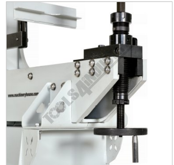
Die Height Adjustment