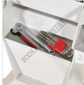
Adjusting Tools Included