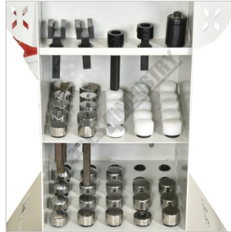
Die Holder Storage