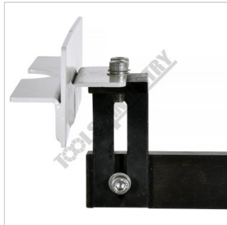
Adjustable Depth Stop Height