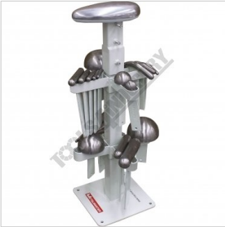
Stand Shown With Optional Dollies