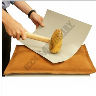
Shown With Wooden Bossing Mallet