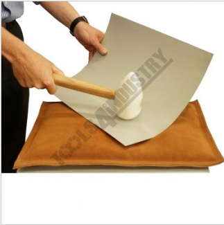
Shown With Nylon Bossing Mallet