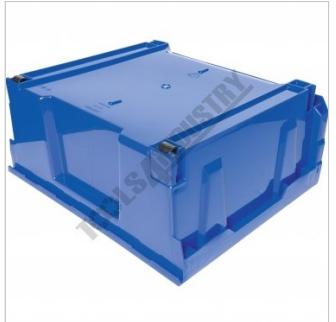
Bottom View with Rear Wheels