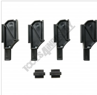
4 Stacking Inserts and 2 Wheels