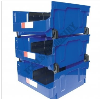
Shown Stacked with Optional Buckets