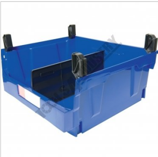
Shown with Stacking Inserts