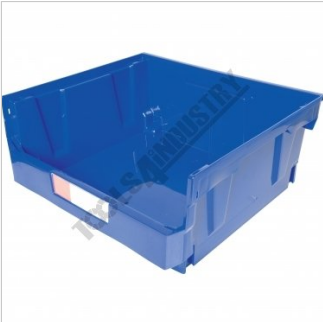
Shown Without Dividers