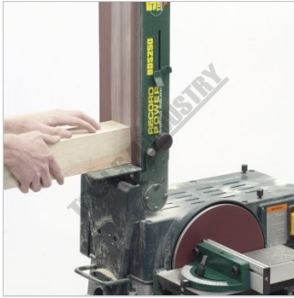
Re Positionable Belt