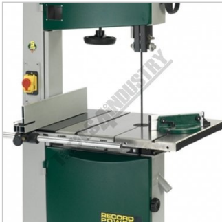
Large 535 x 480mm Cast Iron Table