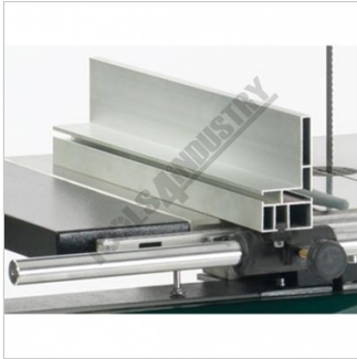
Industrial Style Fence