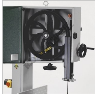
Cast Iron Band Wheels