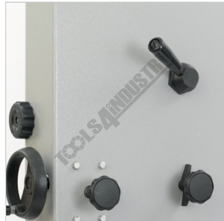
Cam Action Tensioner