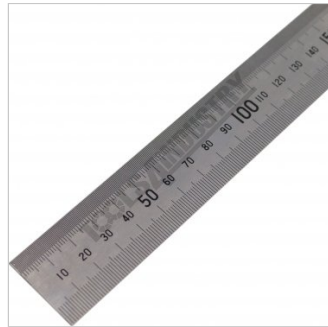
Metric Close Up