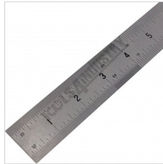
Imperial Close Up