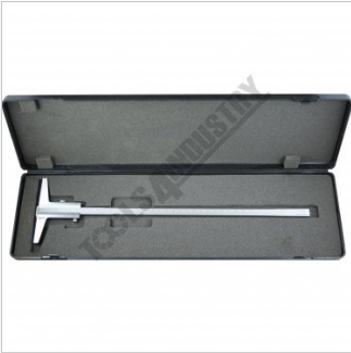
Shown In Box