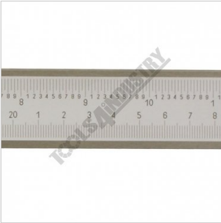
Metric and Imperial Graduations