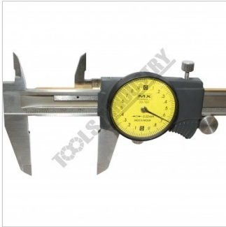
Head Close Up