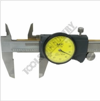
Head Close Up