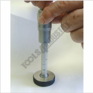
Shown with Setting Ring