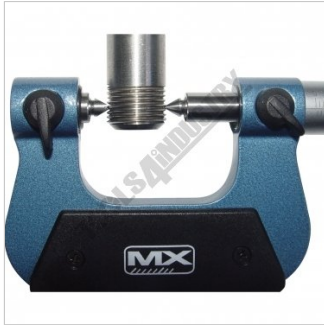
V shaped and cone shaped anvils