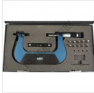
Shown In Box