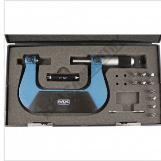
Shown In Box