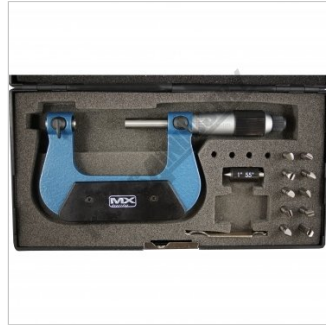
Shown In Box