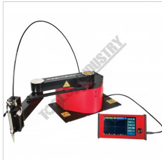
Setup With Trace Pen