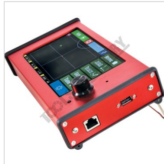
Import Via USB