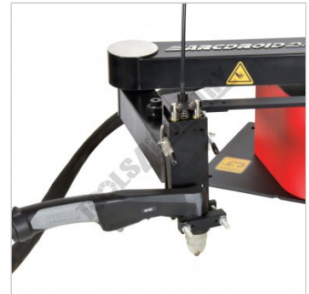
Plasma Torch Cradle