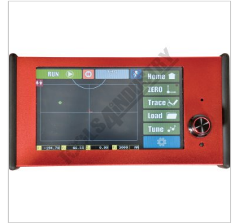
Touch Screen Interface