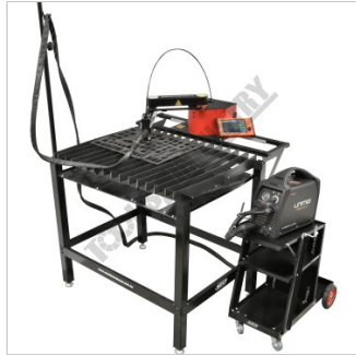
Optional Table and Plasma Torch Setup