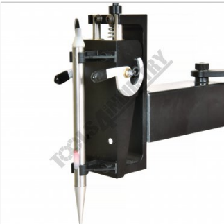
Trace Pen In Holder