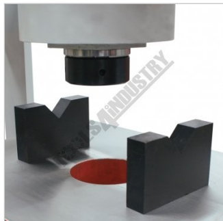
V Blocks On Table