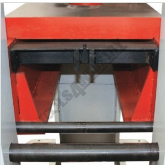
Lifting Parts For Table Height Adjustment