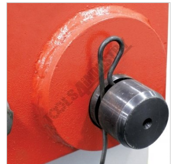
Pin Safety Clip