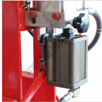
Hydraulic Release Handle