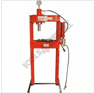
Left Sliding Ram