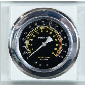
Metric / Imperial Pressure Gauge