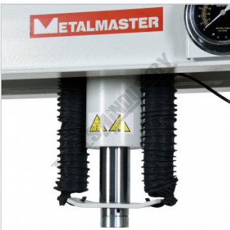
Ram With Safety Covers for Springs