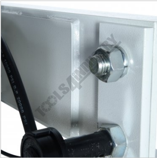
CNC Machine Welded Frame