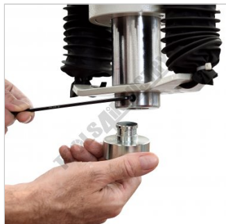
Includes Removable Ram Top Cap