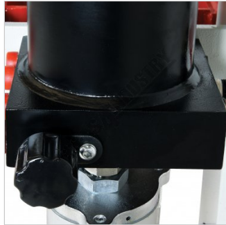
CNC Welded Hydraulics