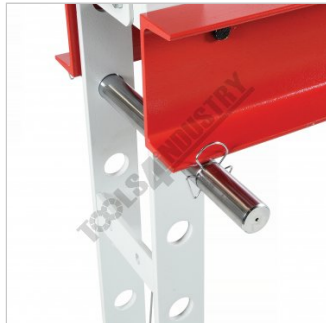
Table Pins With Safety Clips