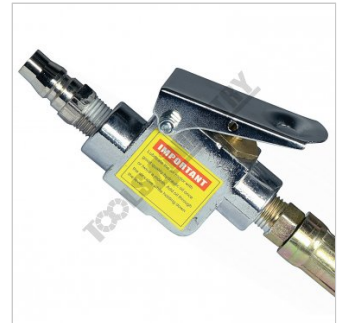
Pneumatic Valve Control