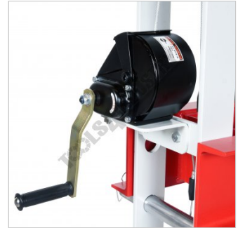
Table Winch Height Adjustment