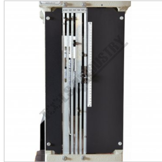
Adjustable Travel Limit Control