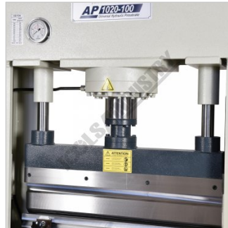
2 x Guide Pistons