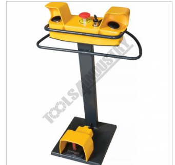
Foot Pedal Control