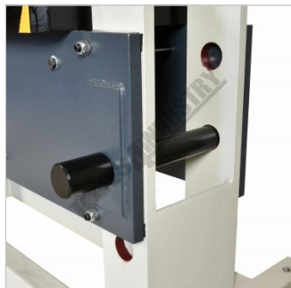
Adjustable Table Height