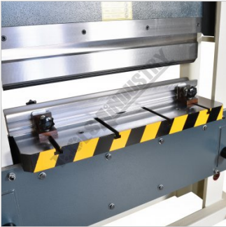
T Slotted Bottom Table