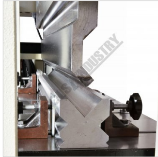
Multi vee Die Block