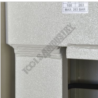
Heavy Duty Steel Welded Frame