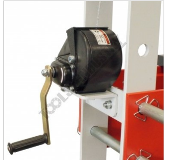
Table Winch Height Adjustment