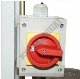
Main Power Isolation Switch