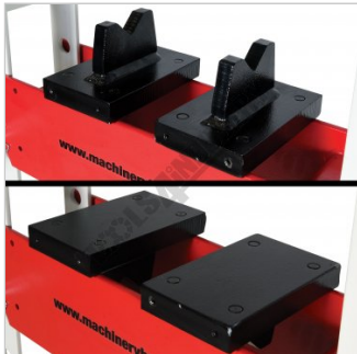
Dual Purpose Pressing Blocks