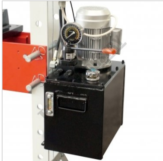
Electric Hydraulic Pump Unit