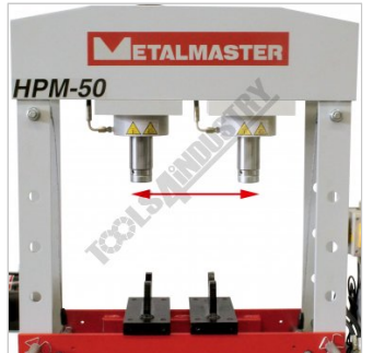
Horizontal Sliding Ram