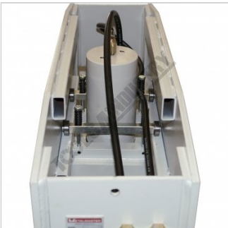
Ram Top With Bearing Slide