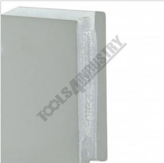
Robotic Welded Frame