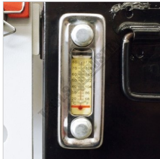
Hydraulic Oil Level Gauge