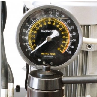
Metric / Imperial Pressure Gauge