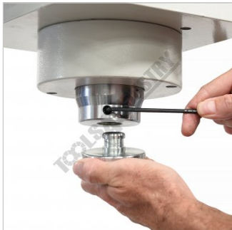
Includes Removable Ram Top Cap