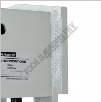
Robotic Welded Frame