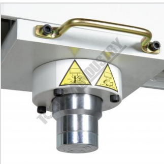
Sliding Ram With Handle