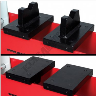
Dual Purpose Pressing Blocks