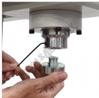
Includes Removable Ram Top Cap