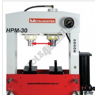
Horizontal Sliding Ram