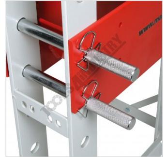
Table Pins With Safety Clips