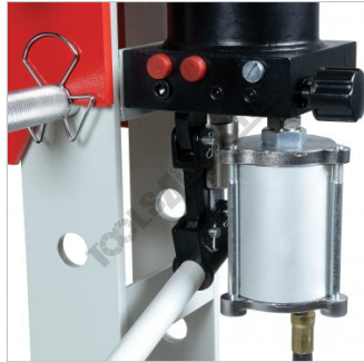
Hydraulic Pneumatic Hand Pump