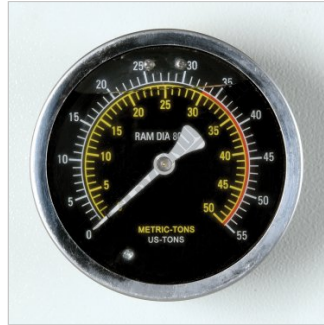
Metric / Imperial Pressure Gauge