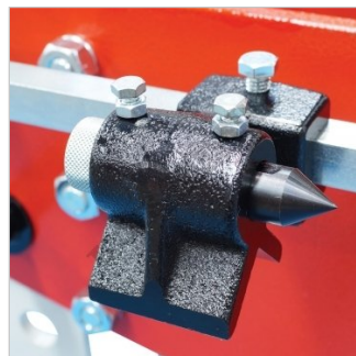
Centres For Shaft Straightening Close Up