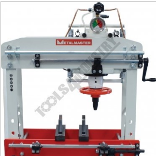
Adjustable Horizontal Ram Right