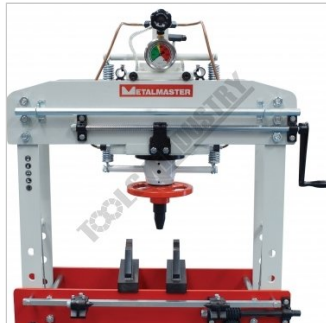
Adjustable Horizontal Ram Centre