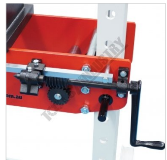
Handle For Table Winch