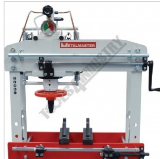
Adjustable Horizontal Ram Left