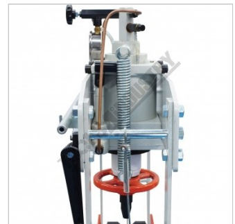
Spring Return on Ram