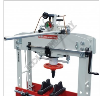
Handle To Operate Ram