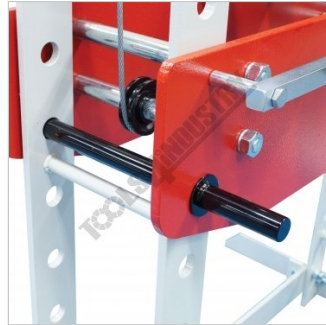
Table Support Pin