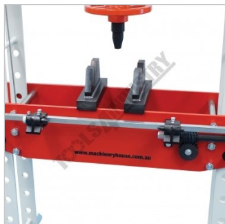
Centres For Shaft Straightening