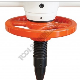
Rapid Approach Hand Wheel