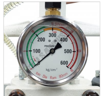
Oil Filled Pressure Gauge