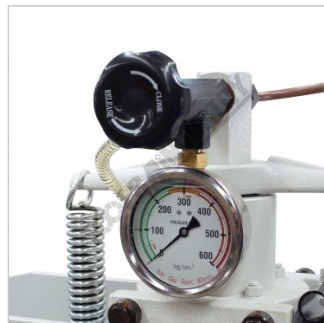
Ram Release Dial