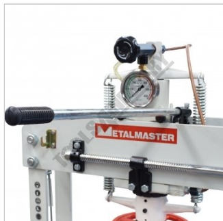
Handle to Operation Ram