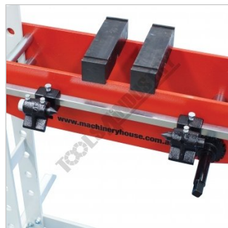
Centres for Shaft Straightening