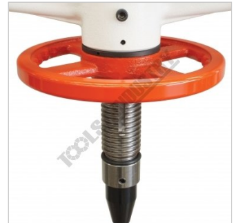
Rapid Approach Hand Wheel