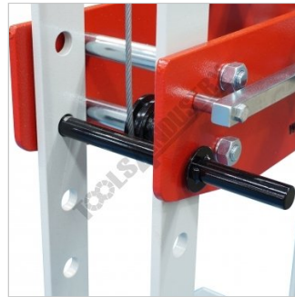
Table Height Pins