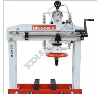
Adjustable Horizontal Ram Right