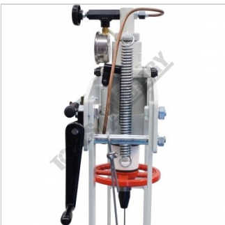
Spring Return on Ram