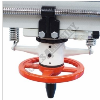
Quick Action Hand-Wheel for Rapid Approach