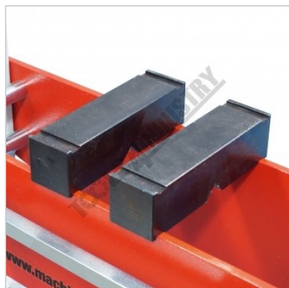
Vee Blocks Reverse Side