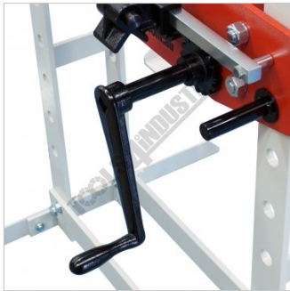
Table Winch Handle