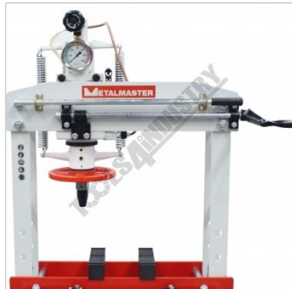
Adjustable Horizontal Ram Left