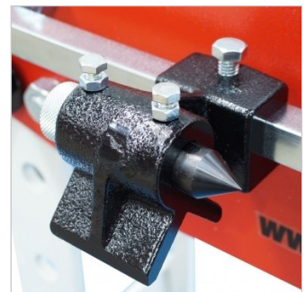
Centres for Shaft Straightening Close Up