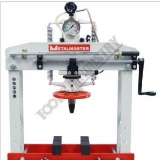
Adjustable Horizontal Ram Centre