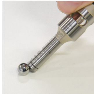
Spring Loaded Ø10mm Ball