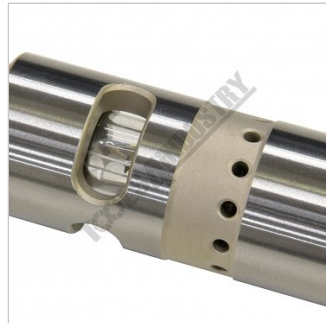
Red Light Illuminates & Audio Beep Sound Alerts for Deeper Holes