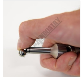
Spring Loaded Ø10mm Ball Shown