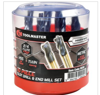
Shown in Plastic Case