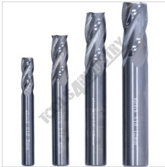
Set Top View