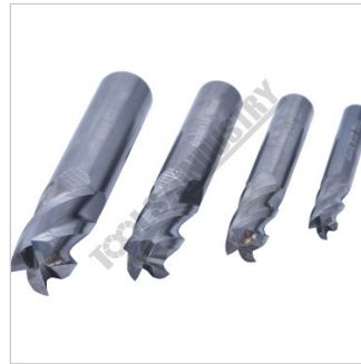
Set End View