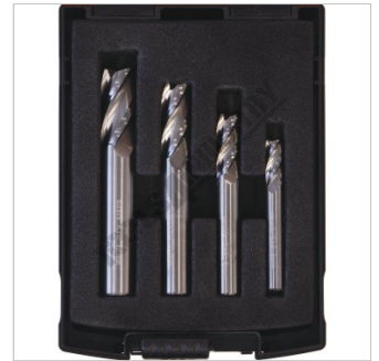
Show in Case Top View