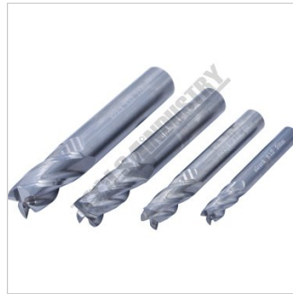
Set Front View