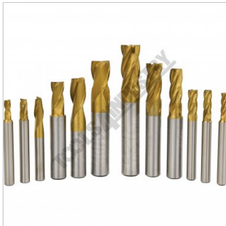
End Mill & Slot Drill Set