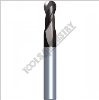
Flute Ball Nose