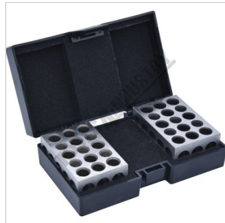
Shown in Case