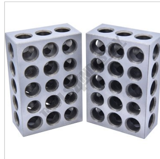
Set View 1