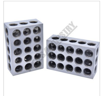
Set View 2