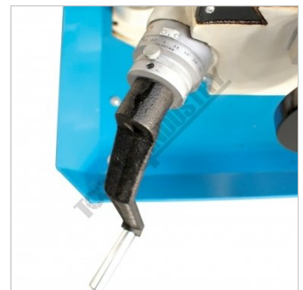
Knee Feed Handle