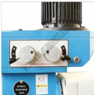
Geared Head Spindle Speed Selectors