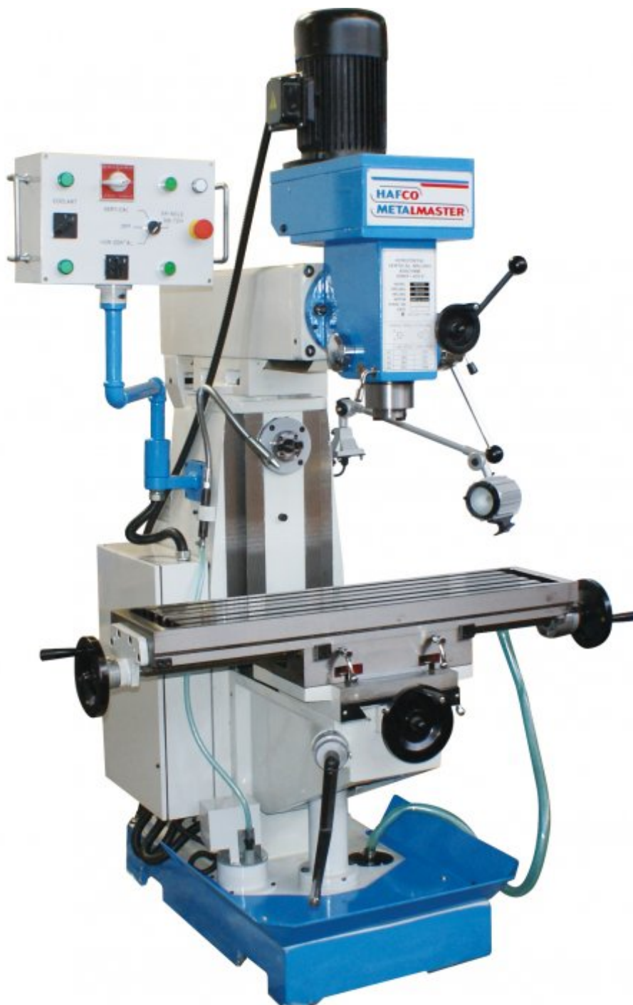
Table Travel: (X) - 600mm (Y) - 200mm (Z) - 340mm

Workshop Turret Milling Machine Geared Head Horizontal - Vertical