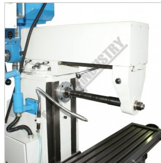
Horizontal Milling Setup