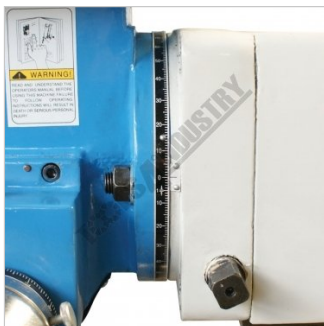
Tilting Head Scale