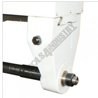
Horizontal Spindle Support