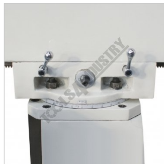
Adjustable Swivel and Sliding Ram