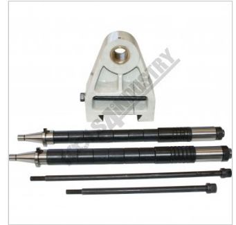
Horizontal Milling Accessories