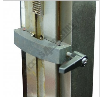
Head Support Lock