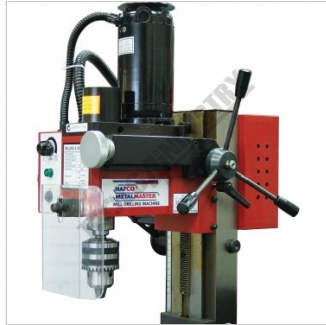
Head Right View