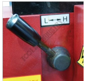
Low High Speed Lever