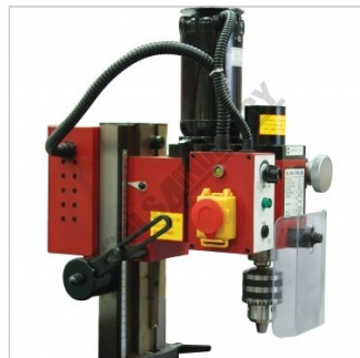
Head Left View