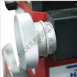
Z-Axis Fine Adjustment Dial