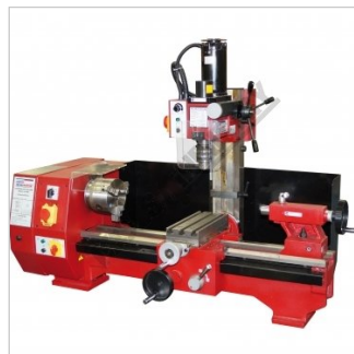
Shown Mounted on Optional Lathe with Milling Table