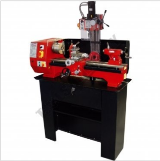
Shown Mounted to Optional AL 60 Lathe