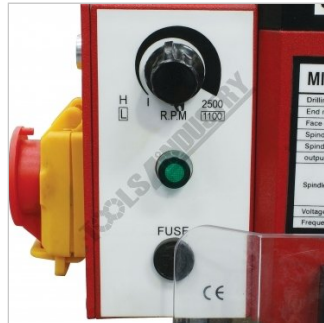
Variable Speed Control