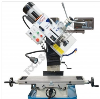
Swivel Head 45 Degrees Front View