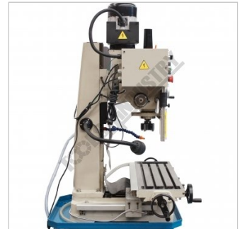
Left Side View Close Up