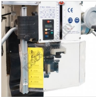
Safety Cutter Guard