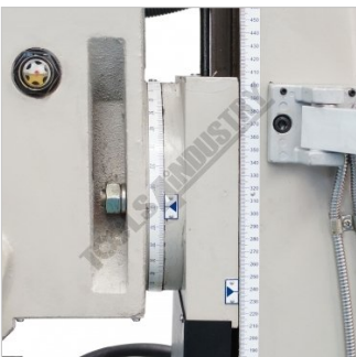
Swivel Head Scale