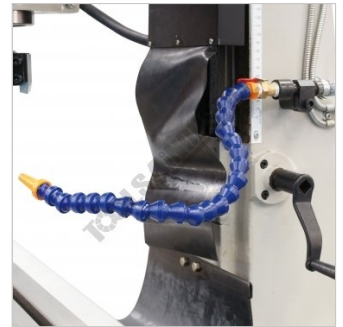
Flexible Coolant Hose