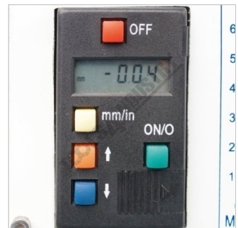
Digital Readout On Quill Depth