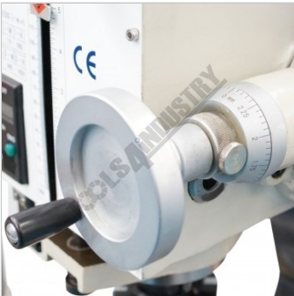
Fine Feed Handle