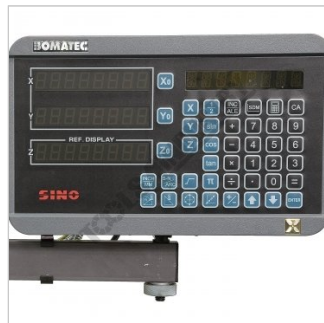
3-Axis digital readout counter fitted with 2-Axis X & Y scales only