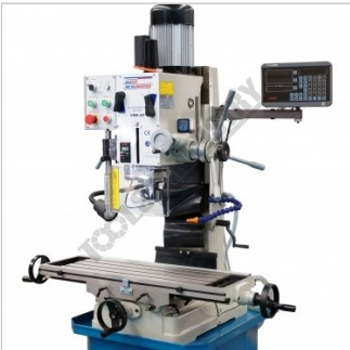
Right Side Close Up