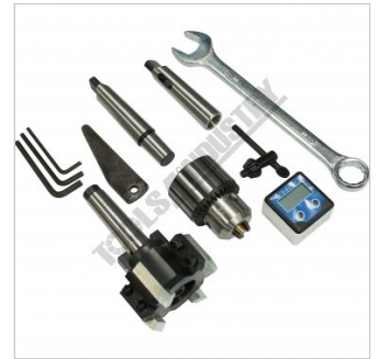
Includes Drill Chuck & Arbor, Milling Cutter, Digital Angle Gauge & Tools