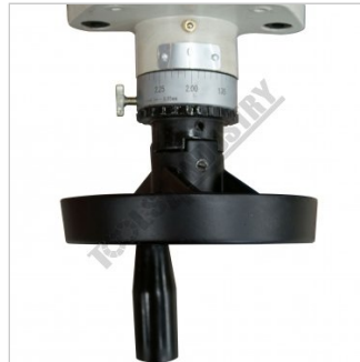
Table Feed Hand Wheel