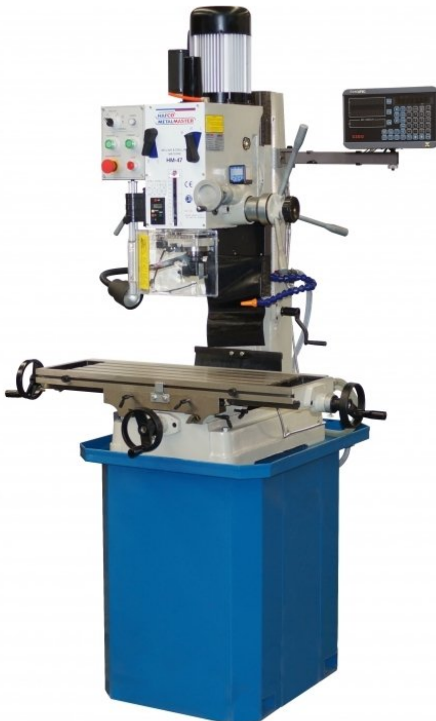
Table Travel: (X) - 540mm (Y) - 185mm (Z) - 410mm

Mill Drill - Geared & Tilting Head with Digital Readout System