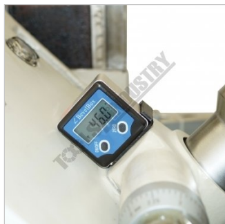
Swivel Head Digital Angle Scale