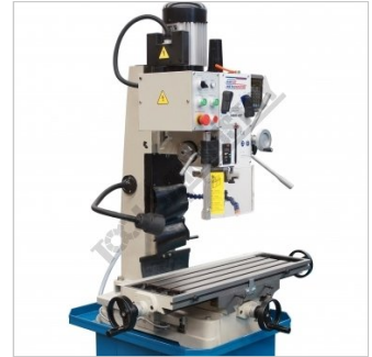
Left View Close Up