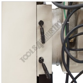
Vertical Axis Locks