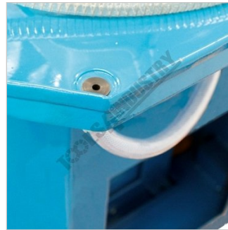
Coolant Return Drain Hose