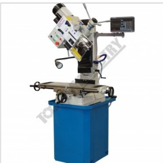
Swivel Head 45 Degrees