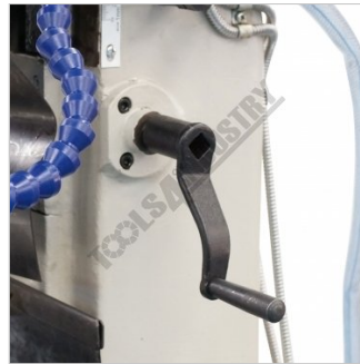
Manual Vertical Height Adjustment Handle