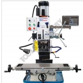
Front View Close Up