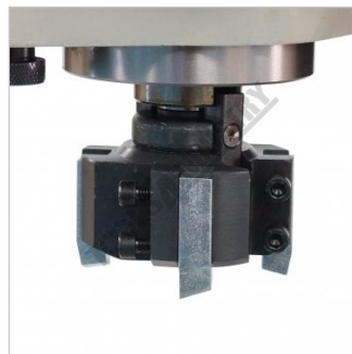
Includes Milling Cutter