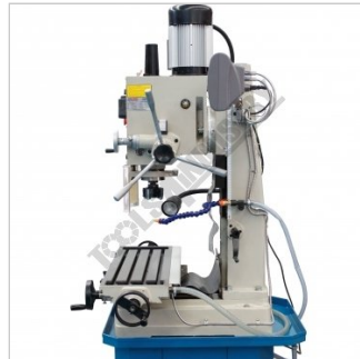
Right Side View Close Up