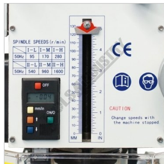
Quick Depth Stop Gauge