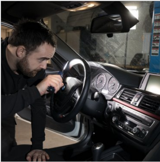
Shown in Use - Automotive Industry