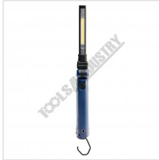
Magnetic Base & Hook Attachment