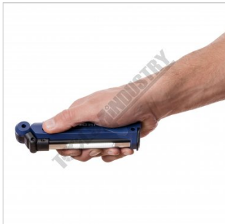
Shown Folded in Hand