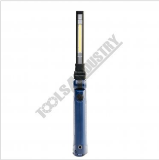
Main Light Front View