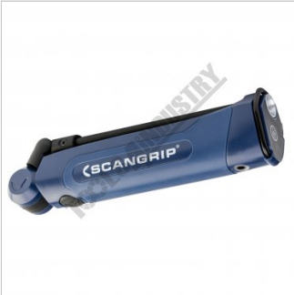
Folded Light Arm