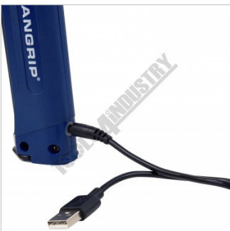
USB Charging Cable