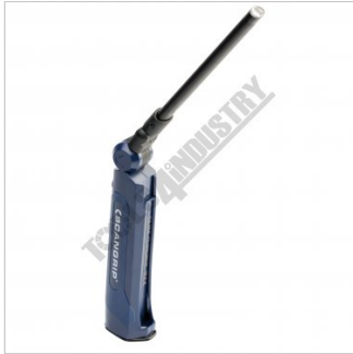
Swivel Light Arm