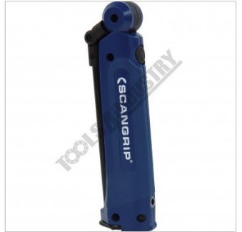
Folded Light Arm