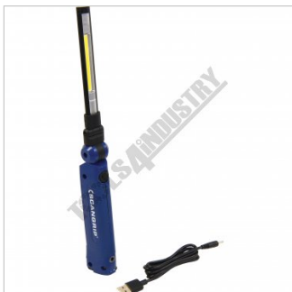
LED Light And Charger