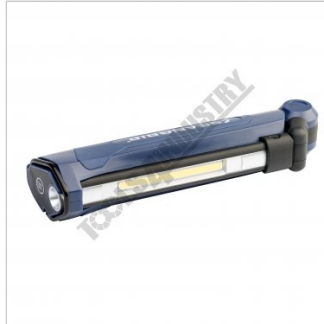
Folded Light Arm