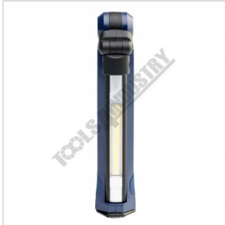
Folded Light Arm