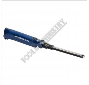
Slim Hand Light