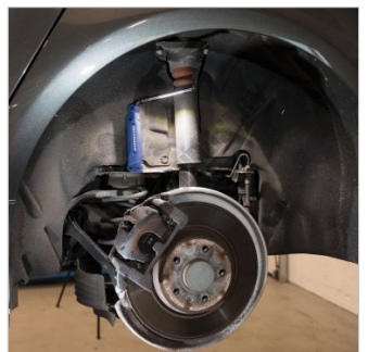
Shown in Use - Automotive Industry