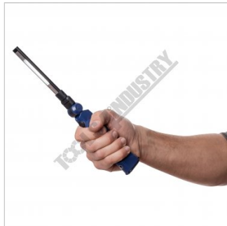
Shown Arm Extended in Hand