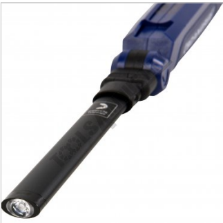
9mm LED Spot Light