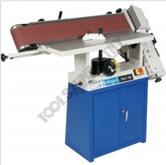
Tilting Sanding Belt 90-180 Degrees