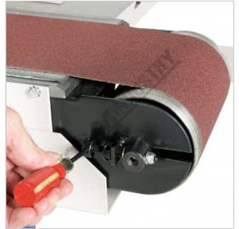
Belt Tracking Adjustment