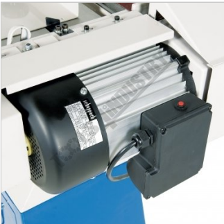
3hp Motor with Thermal Overload