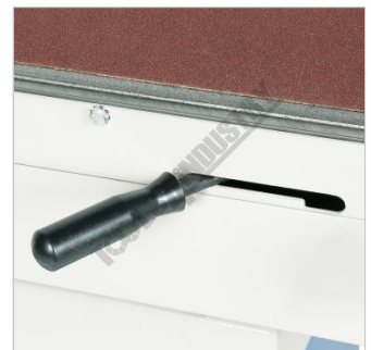
Quick Action Belt Tension Lever