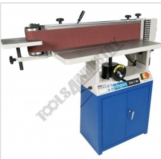
Table Height Lowest Position