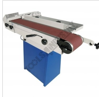
Table Guide Support