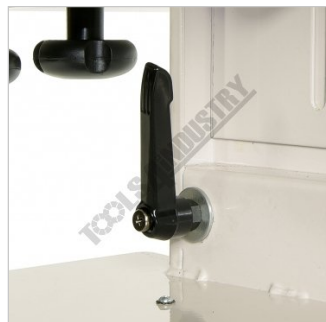
Belt Angle Tilt Lever Lock