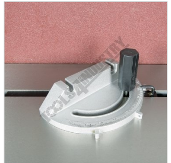
Mitre Guide Scale