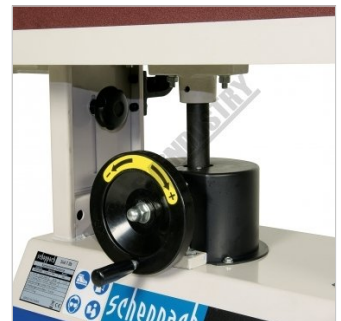
Table Height Adjustment Handle