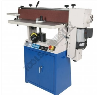
Right Rear View