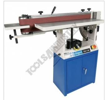
Adjustable Table Height