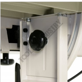
Table Height Locking Knob