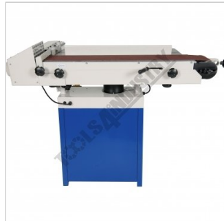
Side View of Belt