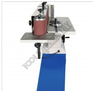
End Table View