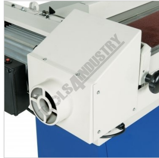
Rear Dust Extraction Port