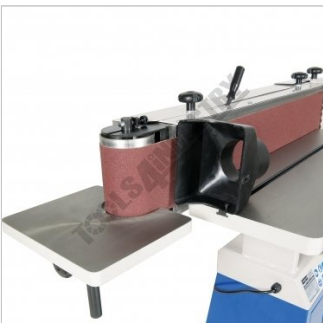
Dust Port for End Table