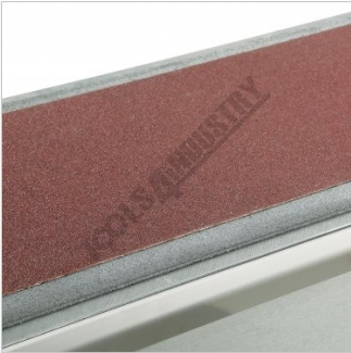
Graphite Belt Pad