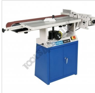
Horizontal Sanding Belt Position