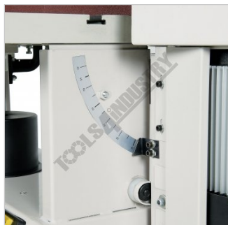
Tilting Table Scale