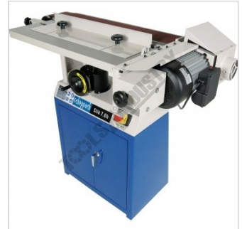
Table Guide Support Rear View