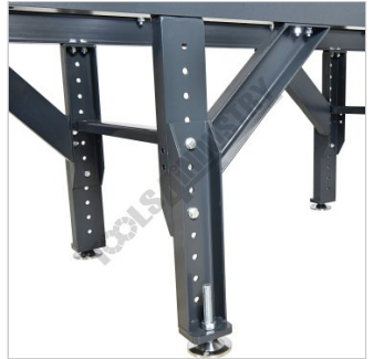
Adjustable Legs and Feet