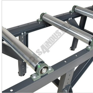
Pre drilled Holes for Extra Rollers