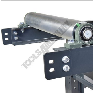
Extendable Attachment Plates