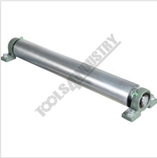
600mm Heavy Duty Ball Bearing Rollers with Grease Nipples