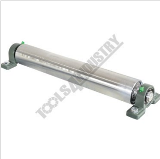
450mm Heavy Duty Ball Bearing Rollers with Grease Nipples