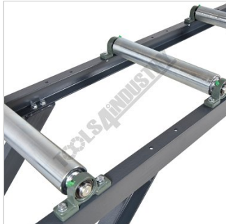
Additional Drill Holes For Extra Rollers