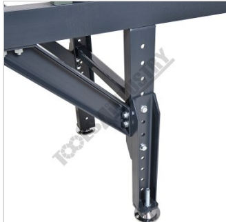
Adjustable Legs and Feet