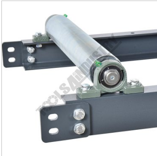
Extendable Attachment Plates