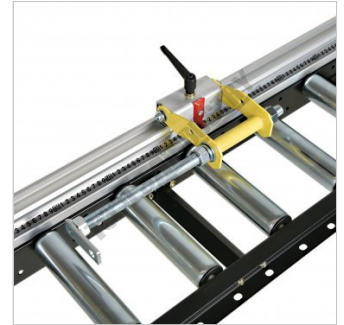
Shown In Stop Position