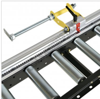
Shown In Open Position