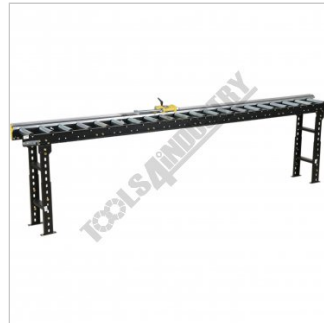
Shown With Optional Roller Conveyor