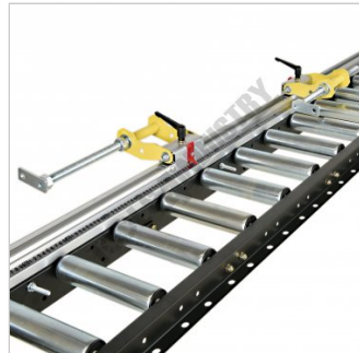
Shown With Optional Length Stop