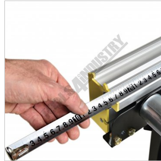
Measuring Scale Insert