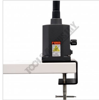
Clamped To Table - Side View