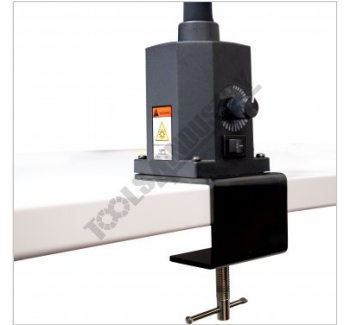
Clamped To Table - Front View