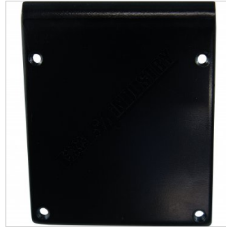
Top Plate, 60 x 60mm Centres