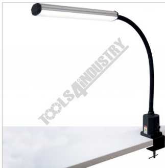
Shown with Lamp Attached